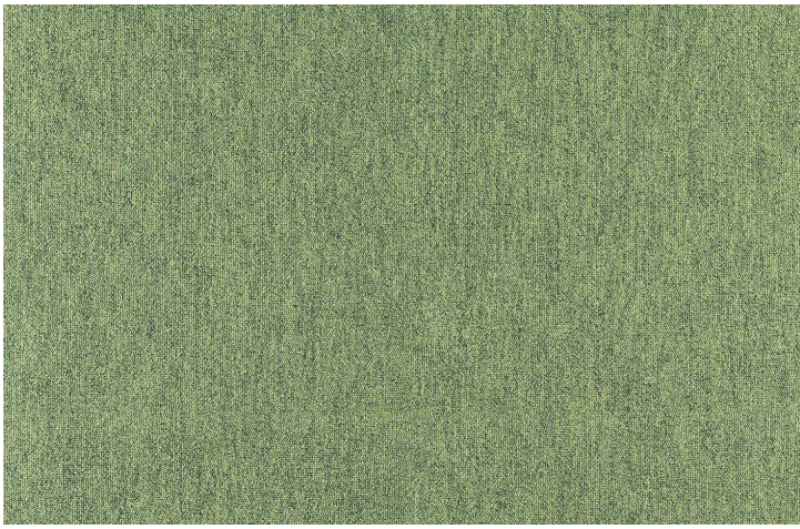
COBALT SDN 64073