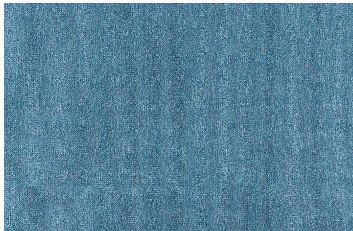
COBALT SDN 64063