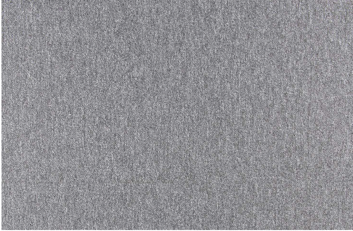
COBALT SDN 64042