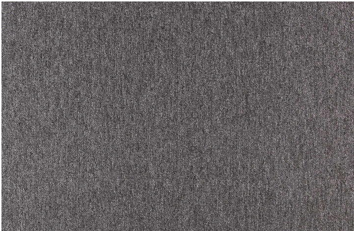
COBALT SDN 64050