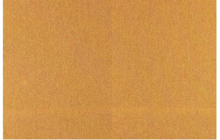
COBALT SDN 64049