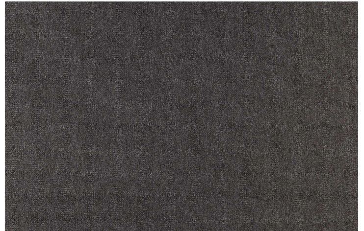
COBALT SDN 64051